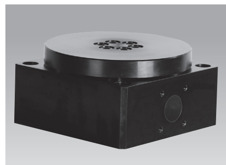
Rotating module – vertical axis DMV 600 with flange plate Ø 170